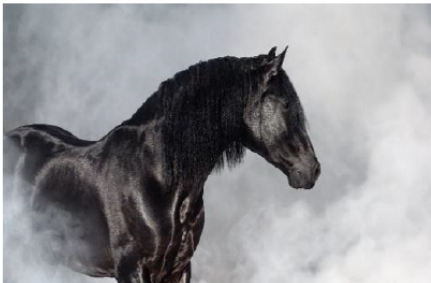
Rob & Clare look forward to welcoming you

~ See our food boards inside the pub or on Facebook for menus ~ You can book the extension for your function any day of the week