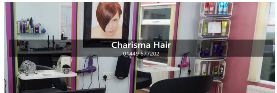
Charisma Hair 01449 677202

DESIGN • PRINT • LARGE FORMAT MAILING • PROMOTIONAL GIFTS • SCANNING